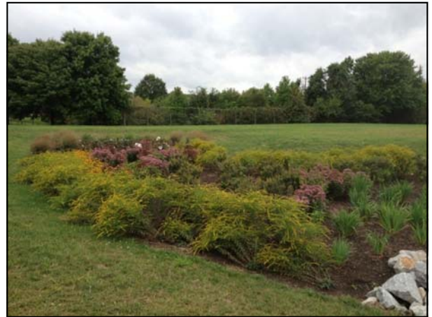
Bio retention area near the Bob Carpenter Center