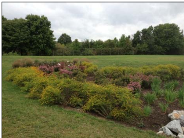
Bio retention area near the Bob Carpenter Center Addition

So, when you walk around campus enjoying the beauty of our UD landscaping, think about the ways in which we are managing our stormwater to reduce runoff, recharge the groundwater, and create cleaner water for the flora and fauna in the stream as well as for ourselves!