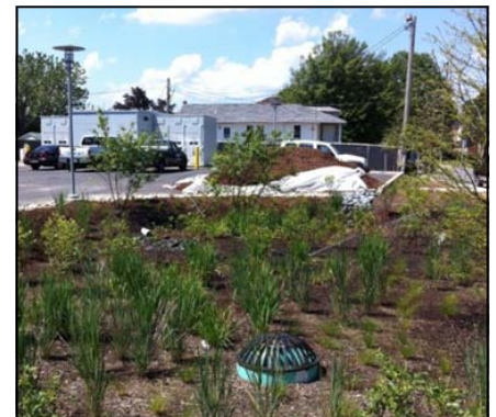
Bio retention area near the East Campus Utility Plant